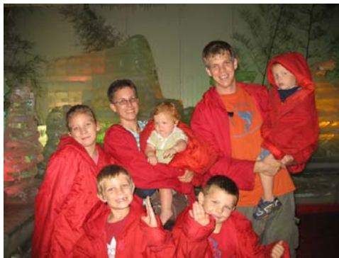
Our family at Snow World!

when they have a special holiday or celebration we are privileged to witness it first hand. The first one we witnessed was the month of Ramadan. During this month the people fasted from sun up until