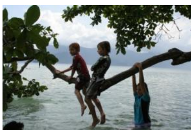
Playing on a tree at the beach. We went with our church.