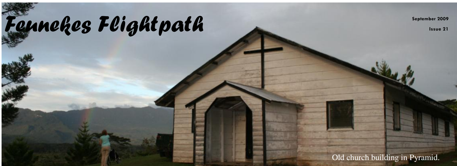
Old church building in Pyramid.

Since our last newsletter we have received confirmation that we are able to return to work here in Papua for a second term. Thanks to all of you who have supported us and made this possible! We feel very excited and humbled by this blessing. We thoroughly enjoy our work and life here. We have built up relationships and figured out how and where we can help and our language has gotten to the point where we are fairly fluent. Therefore we felt led to ask for a second term. One always hears about how it takes one term just to figure things out and build relationships, and now we can say with experience, that that statement is true.