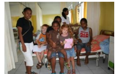
Visiting Ice during her first hospital stay.