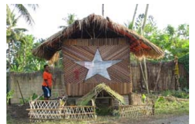
One of the local Christmas booths made especially to play loud Christmas music for hours on end sometimes even all night long!