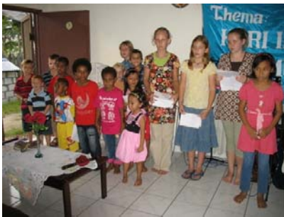
The kids of our church singing on the Christmas praise evening.